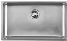
Sink KE - R15 Vintage 2157 080